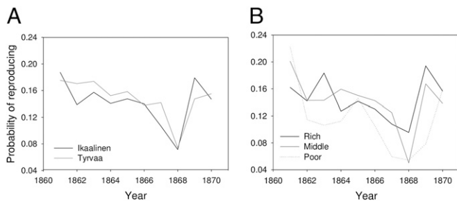
Fig. 3. Individuals in Ikaalinen and Tyrvää were less likely to produce children during the famine (1867–1868). (A) In both parishes, individuals were less likely to reproduce during 1868 especially. (B) This was particularly pronounced in the poorest social class, individuals of which also experienced lower reproductive rates during 1867.

survival of the 1- to 10-y age group (Fig. 2B) suggests that experiencing poor early nutrition may not confer adaptive benefits for survival in poor childhood environments, as suggested by notable alternatives to the PAR model (8, 32). It has also been suggested that developing individuals may derive information about the external environment as a long-term signal that integrates many years of maternal experience, through the environment in utero (33). Finally, selection for developmental plasticity may be driven by an immediate survival advantage during early postnatal life. Results consistent with plasticity providing an early-life survival advantage were reported by a study of infants (mean age 12 mo) admitted to Jamaican hospitals with kwashiorkor, a symptom of malnutrition associated with edema but retention of some fat and protein reserves, and marasmus, a symptom characterized by a lack of edema and wasting. Individuals who responded to malnutrition with kwashiorkor experienced higher mortality and were significantly heavier at birth than those displaying marasmus, suggesting that lighter-born individuals used their energy reserves more efficiently to survive a period of malnutrition (34). These results were interpreted as evidence consistent with a short-term PAR. Our annual-based data were unable to test for such short-lived effects, and so such studies are a welcome addition to the debate (33).